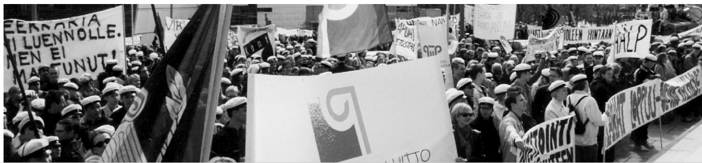
University researchers and teachers for university funding in 2000.

The union has close to 7,000 members, and the most common titles of its members are: university lecturer, research doctor, early stage researcher, post-graduate student, researcher, librarian/information specialist, university teacher, designer.